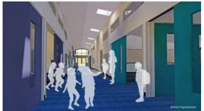
Stage 1 - inside the Junior Learning Building