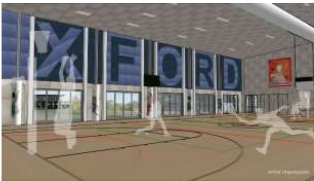
Stage 2 - inside our Community Hub / Gymnasium