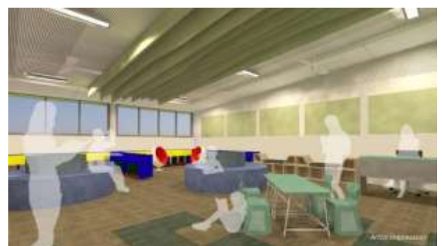
Stage 2 - refurbished Library (existing BER building)