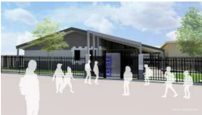
Stage 1 - the new Administration building and main entry to the school (our precious Mosaic wall will be mounted on the side of the Admin building)