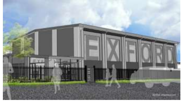
Stage 2 - street view of our Community Hub / Gymnasium