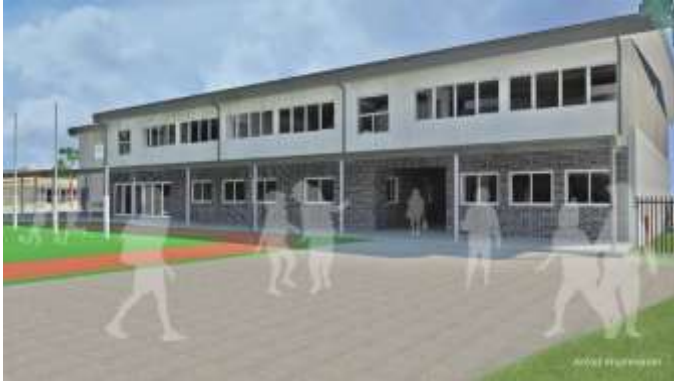
Stage 2 - Senior Learning Building