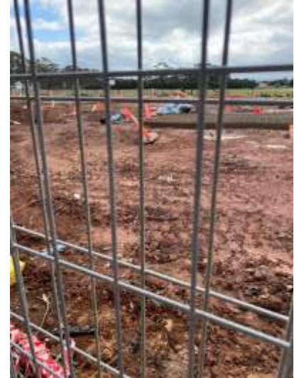
Getting ready for the concrete pour for the first half of the Junior Learning Building.