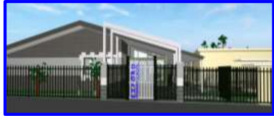
Artist impression of our new school entry - ready 2022!

Where Children Count! www.exfordps.vic.edu.au