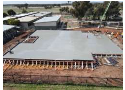
The concrete pour for the first half of the Junior Learning Building