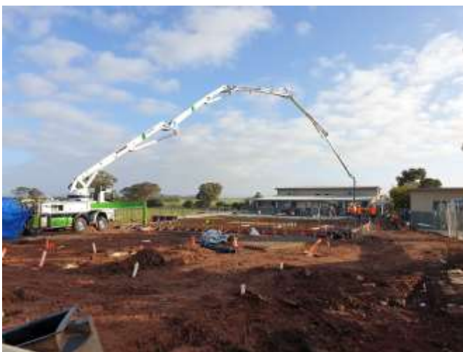
The crane which poured the concrete for our Junior Learning Building.