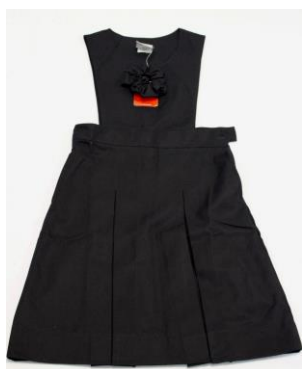
Girls Winter Tunic - Navy Blue $55 (Size 4 - 6) $57 (Size 8 - 10)