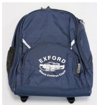
School Bag $53