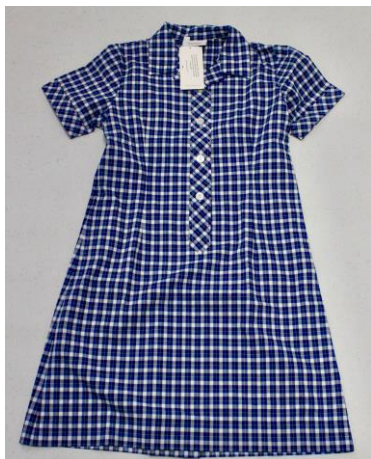
Girls Summer Dress - Blue / White $49 (Size 4 - 10) $50 (Size 12 - 16)