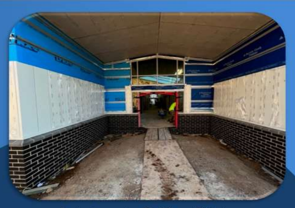
Junior Learning Building - Exterior