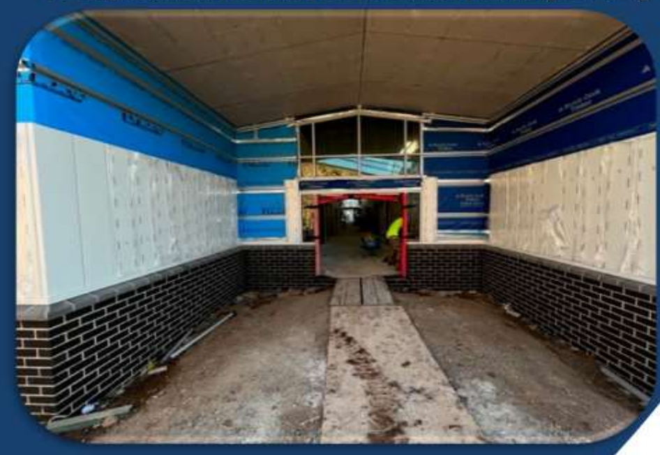
Junior Learning Building - Exterior