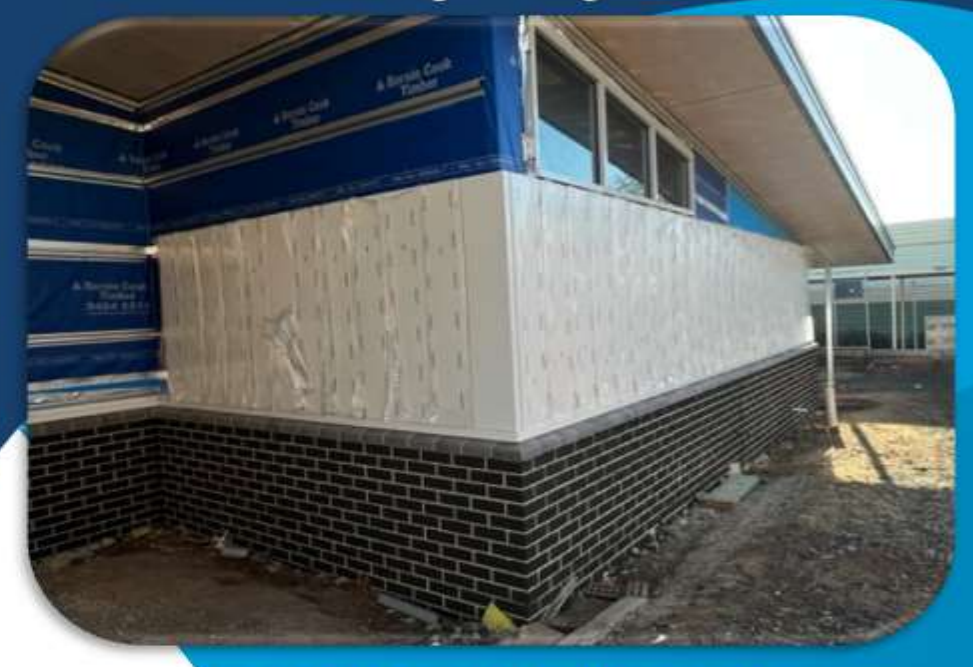
Junior Learning Building - Exterior