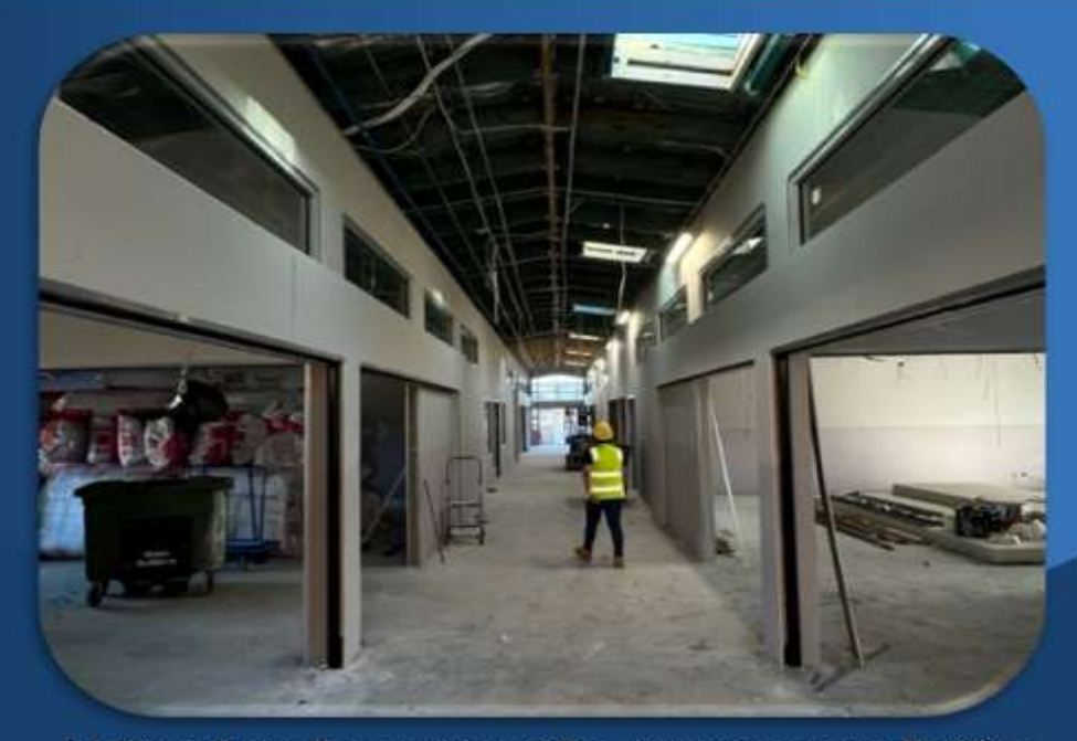
Looking down the corridor of the Junior Learning Building