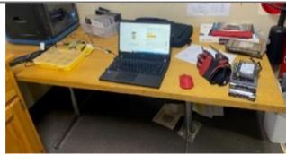
Table from old ICT room - $15

Measurements – 1200 mm (w), 600 mm (d), 800 – 1000 mm – adjustable height