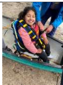
Gurman was ready to go canoeing.