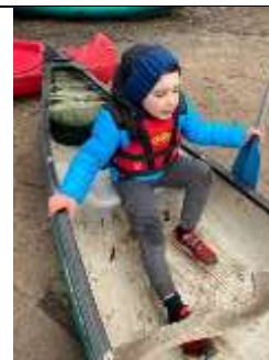
Eamonn would have liked to go canoeing for the whole time!