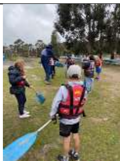
Practising our paddling prior to the canoeing activity.