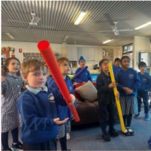
Feeling the beat!