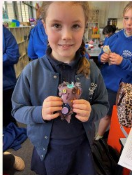
Harper's finished ugly doll.